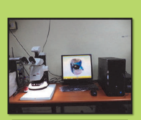
LEICA Stereo zoom microscope