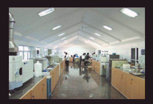
Instruments Lab - Marine sciences