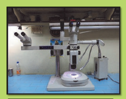
TRINOCULAR STEREOSCOPIC ZOOM MICROSCOPE