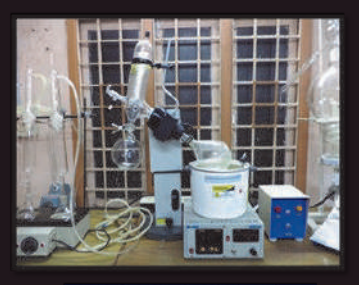
ROTARAY VACUUMFLASH EVAPORATOR