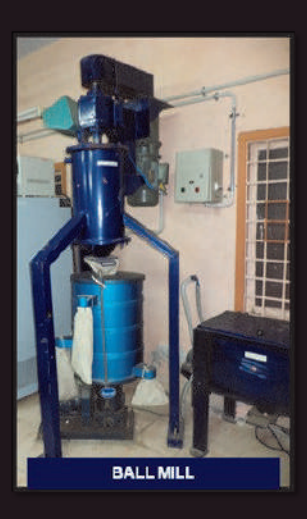
Instruments at Faculty of Agriculture