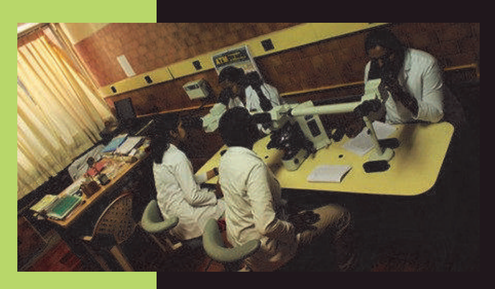
Oral Pathology P G Lab